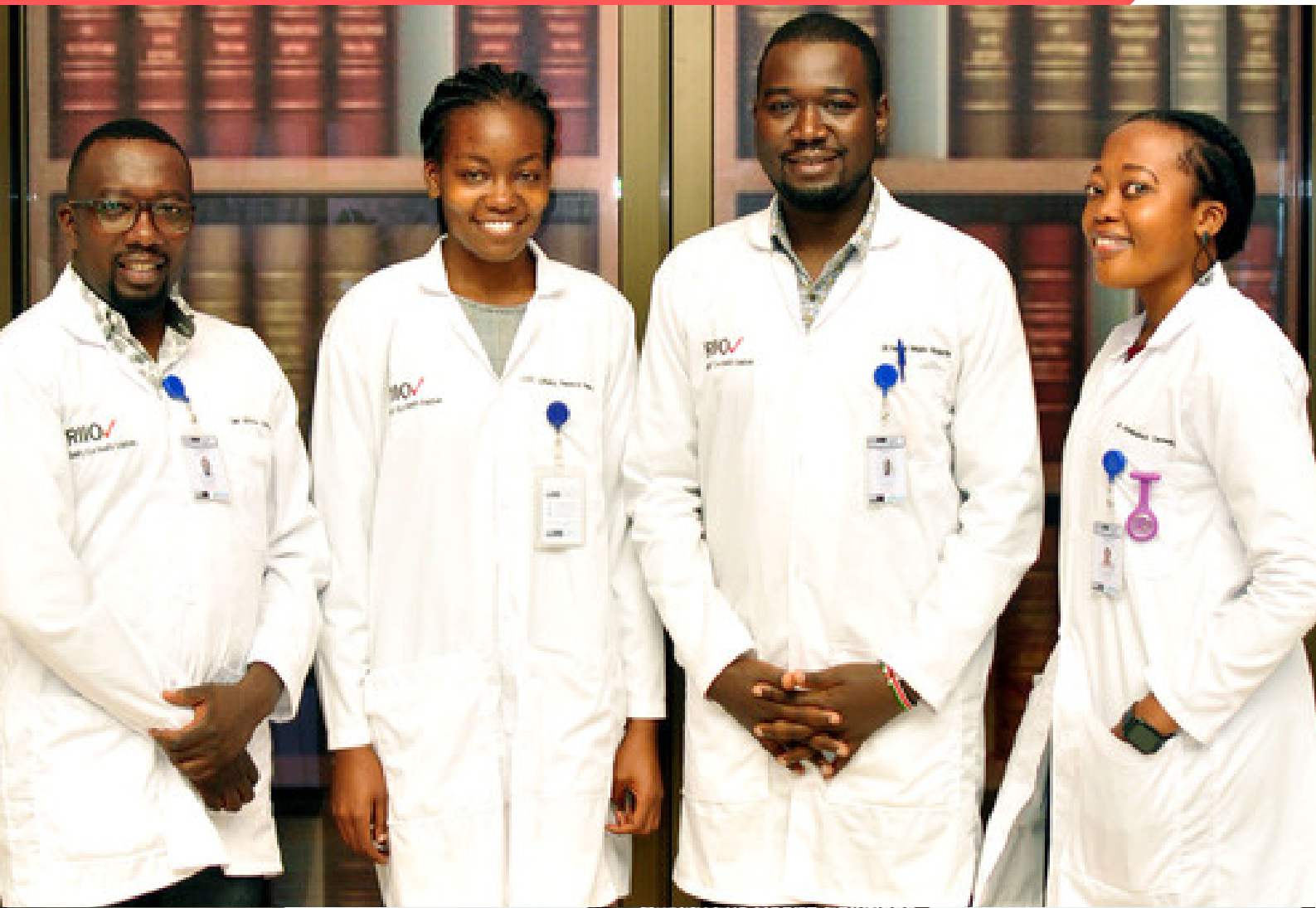
Quality Eye Health Solutions