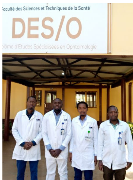
RIIO RESIDENTS pose outside the CADESSO Training Site in Guinea.

As a result of this commitment, All Residents have successfully performed and been promoted in the next batch. Out of 10, 4 have passed in 4th Year while 6 have been promoted in 3rd Year. the next academic year is scheduled at the beginning of August 2021.