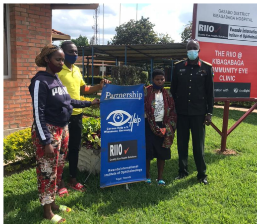
RIIO DIRECTOR POSES WITH CORNEA TRANSPLANT RECIPIENTS.