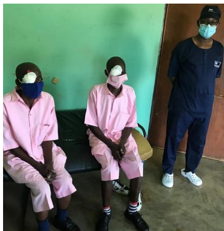
Patients accompanied by RIIO resident after undergoing Cataract Surgery.